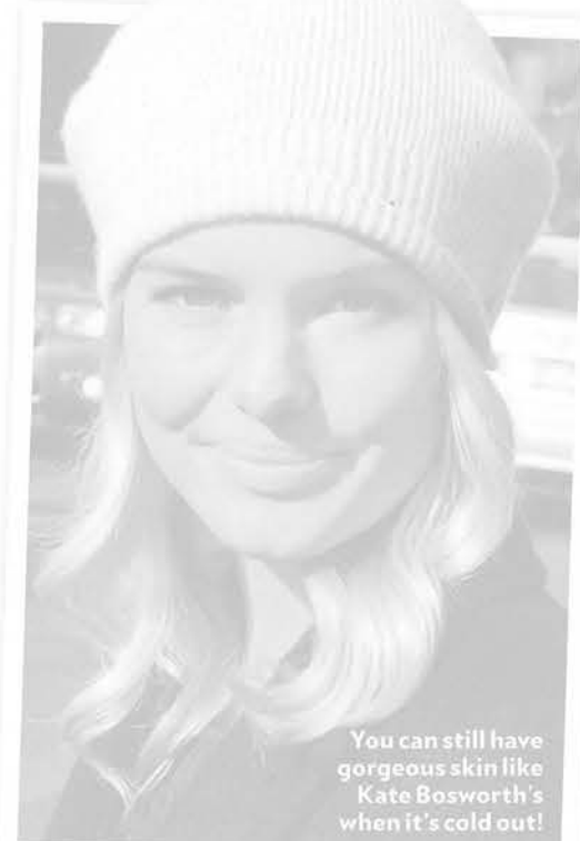
You can still have gorgeous skin like Kate Bosworth's when it's cold out!